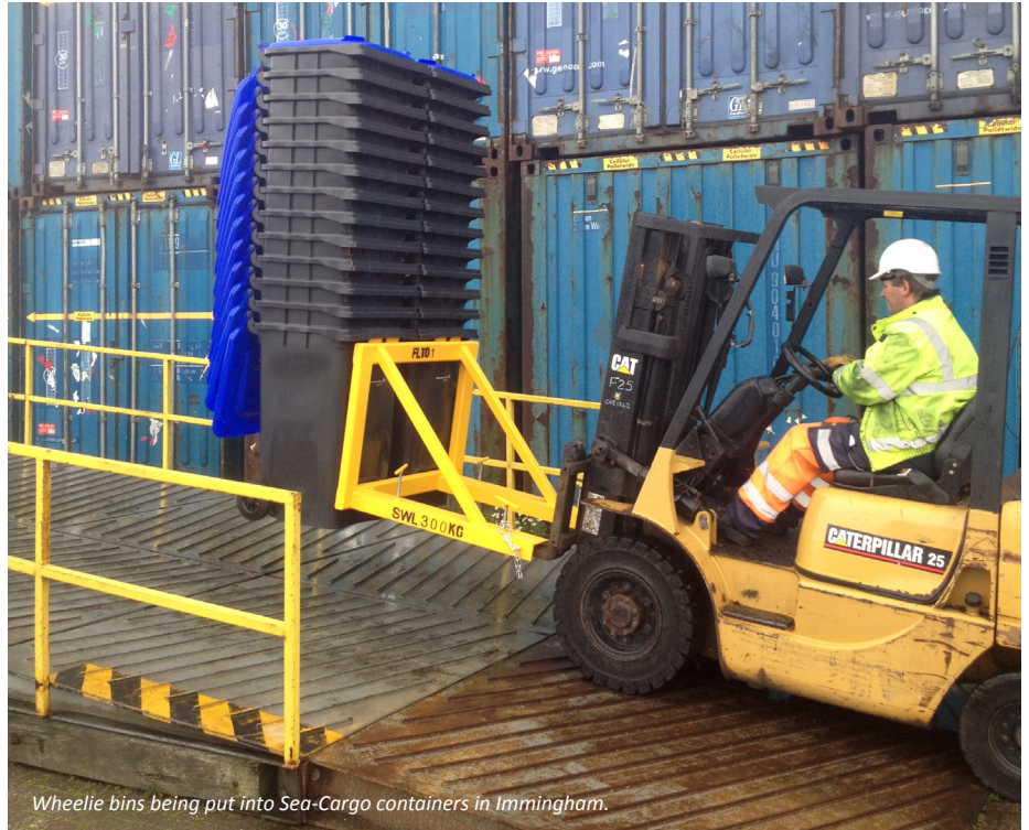
Wheelie bins being put into Sea-Cargo containers in Immingham.

“Craemer UK are leading UK manufacturers of plastic wheelie bins based in Telford in Shropshire. Craemer are currently contracted to supply 75,000 plastic wheeled bins to Aberdeenshire Council and from the onset of the contract we were keen to establish a supply link between our Telford factory and the Council which was both cost effective and as environmentally friendly as possible. Sea Cargo and Northwards have been able to satisfy both criteria by employing a unique combination of road and sea transport enabling us to supply the Council’s bin distribution programme on a just-in-time basis” says Steve Poppitt, UK Sales Director of Craemer UK Limited.