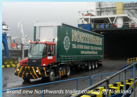
Brand new Northwards trailer coming off Norrland.

With a local contact point in Aberdeen we achieve better control of arrival of loads to the end destination, which results in better